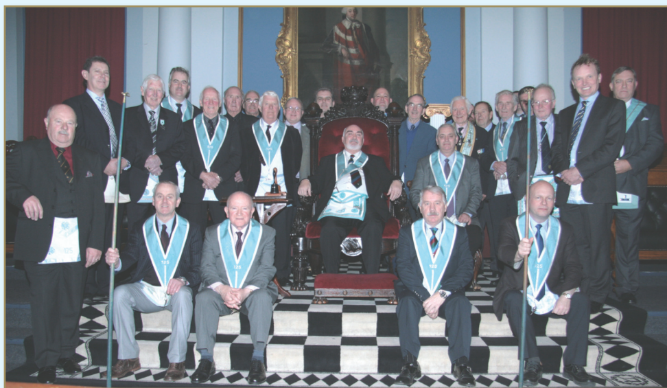
Officers and Members of The Lodge of Fidelity No. 125 photographed at a recent meeting in the Grand Lodge Room.

This year the Lodge of Fidelity No. 125 proudly celebrates its 175th Anniversary. The Warrant for the Lodge was issued on the 20th November 1837, a year that heralded a momentous period in World affairs, being the Coronation year of Queen Victoria. These were exciting times for the formation of a new Lodge, the founding Brethren embraced the enthusiasm of the Victorian age and their Masonic activities with a vigour and so laid the solid foundation upon which this Lodge still flourishes today.