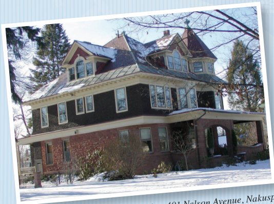
Queen Anne Turret Bed & Breakfast 401 Nelson Avenue, Nakusp.

2012 - Ireland! We have a school teacher, in our Village, who's currently doing a professional exchange with his counterpart in Australia.